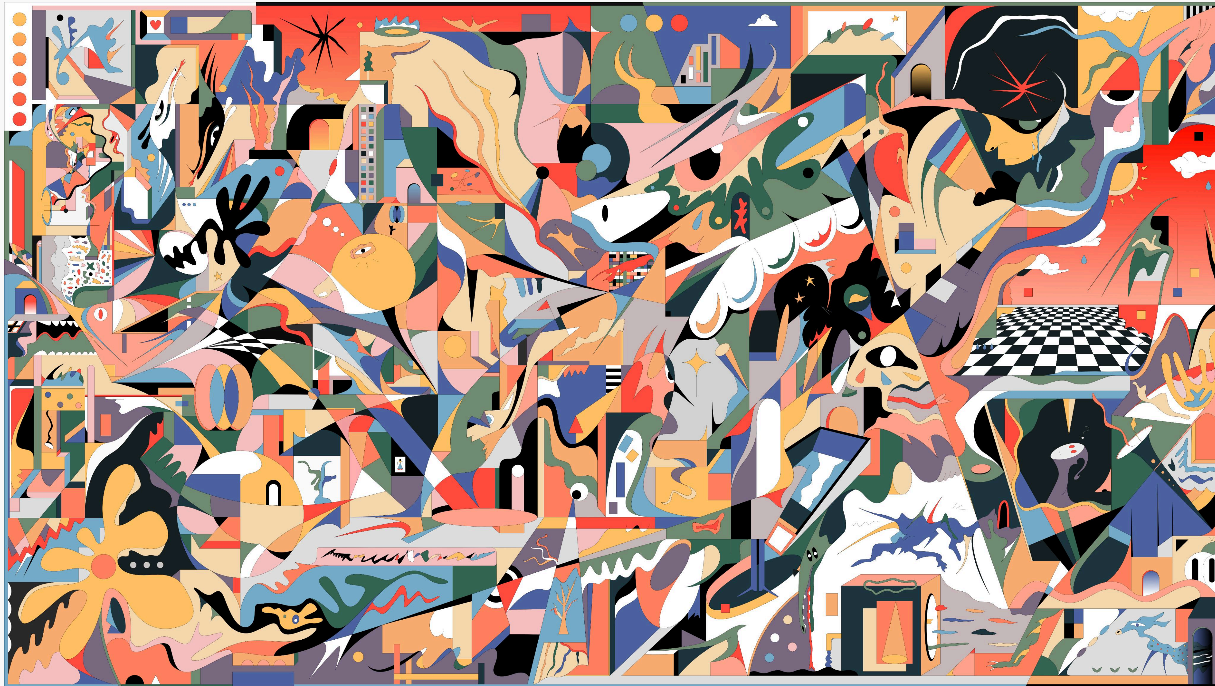
Prelimbus Vector Art

Created in 2024. Digital sketch turned into vectors. My exploration with this piece was to further complicate my forms.